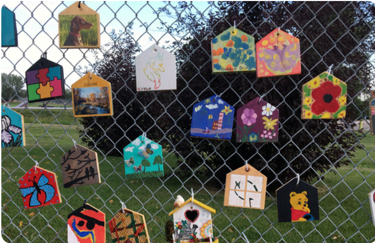
Deer Run CA

Team up with local artists and creatives to create public art that reflects identity and builds a sense of belonging.