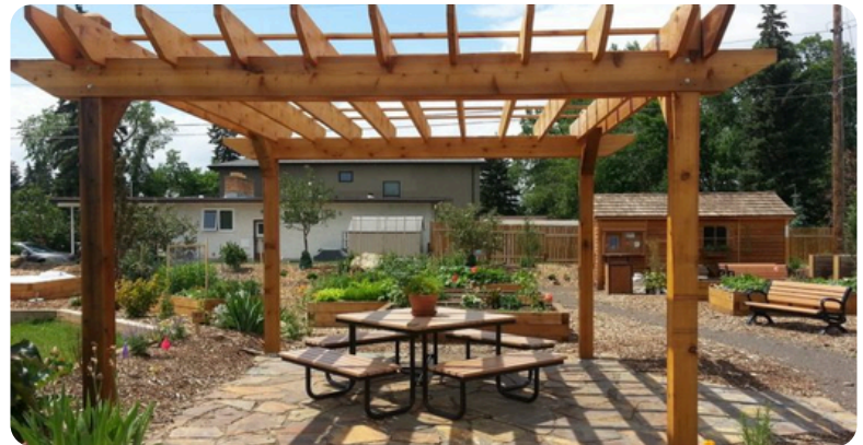
Winston Heights - Mountview