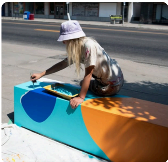
Crescent Heights BIA