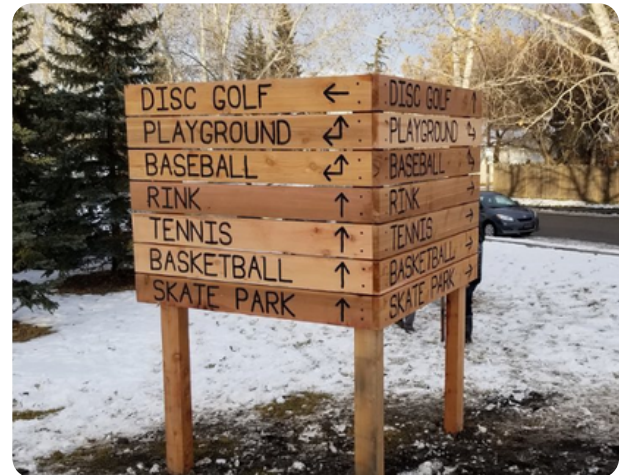
Bonavista Downs CA