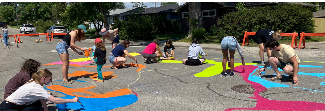
Southwood Paint the Pavement, 2023