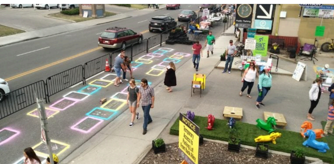
Renfrew CA, Edmonton Trail Day, 2017

If you have any questions or need clarification on any items listed eligible/ineligible, please reach out to our grants team before purchasing or expensing items.