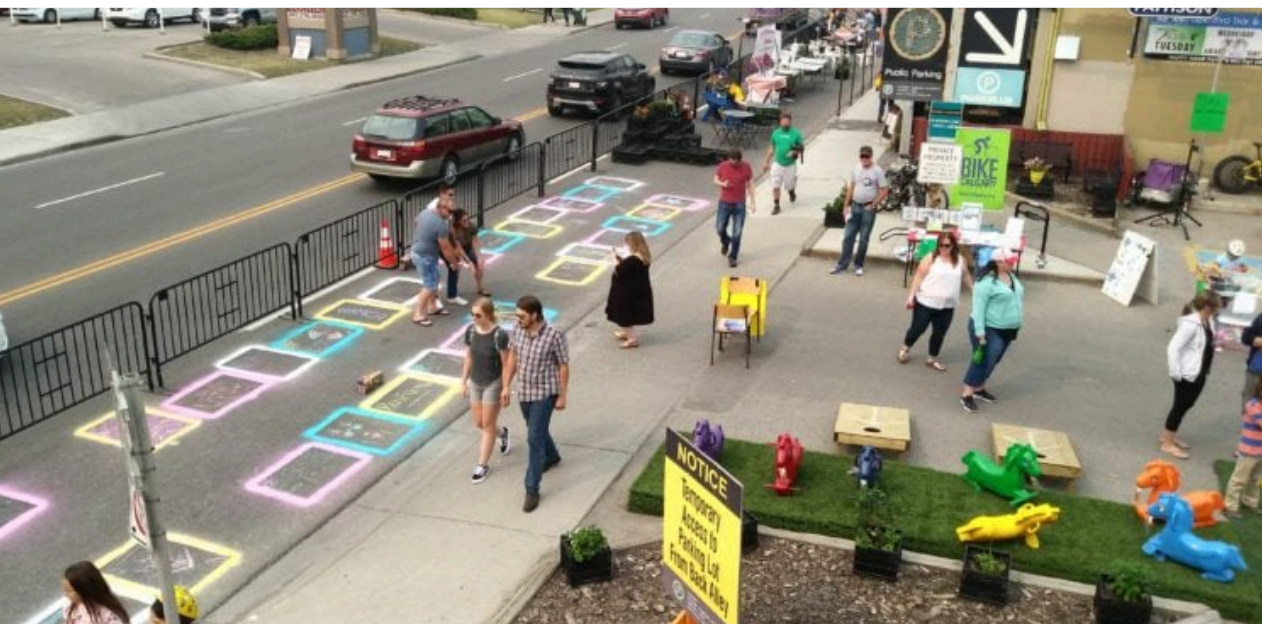
Renfrew CA, Edmonton Trail Day, 2017

If you have any questions or need clarification on any items listed eligible/ineligible, please reach out to our grants team before purchasing or expensing items.