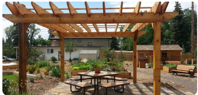
Winston Heights - Mountview