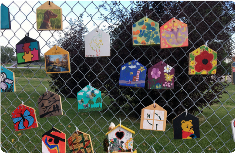
Deer Run CA

Team up with local artists, creatives, and community members to create public art that reflects identity and builds a sense of belonging.