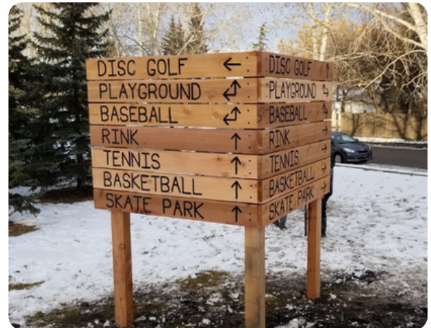
Bonavista Downs CA